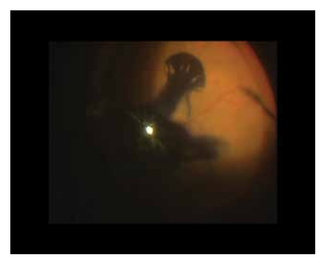
Fig. 2 - The diffusion of the dye highlights the extension of the vitreous detachment towards the periphery.

One of the possible limitations of this technique is that the circulation of the dye can cause a reduction of intraocular